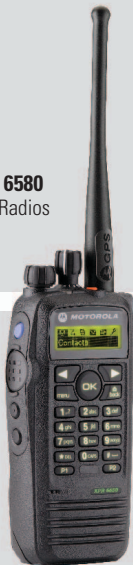
XPR 6550 / XPR 6580 Display Portable Radios